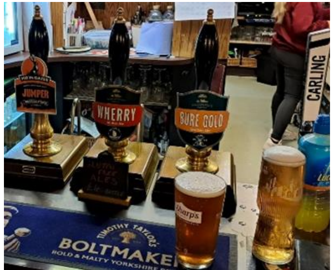
Above; Happy to see three dark ales for the first time. Right; Amber, Amber, Gold. Are these two line-ups balanced? The Bure Gold is down as a Gold, but has hints of citra proving names can't be trusted