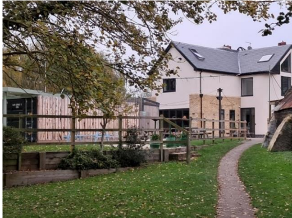
The back entrance to the Three Pickerels, Mepal. The pub is virtually new with tens of thousands £££££ spent. A lazy day in the countryside by the river - this is the place.

There's an excellent walk from the very edge of Sutton to Mepal and if you park at the far end of Tramar Drive you can cross the road and walk through a nicely shaped tunnel through 400 metres of shrubs and trees. This then takes you past recommend it. Cambridge Machinery Sales and even more 'tunnel' onto Mepal. A local dirt lane has been