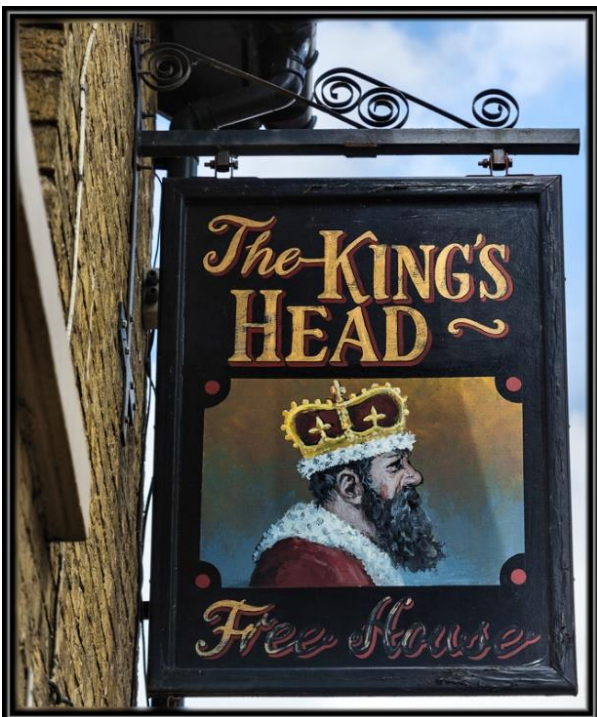
Which King of England is this a likeness of? I'm struggling to think it was anyone with a lovely great big bushy beard like this but, I suspect it's a mixture of many. Maybe George V?