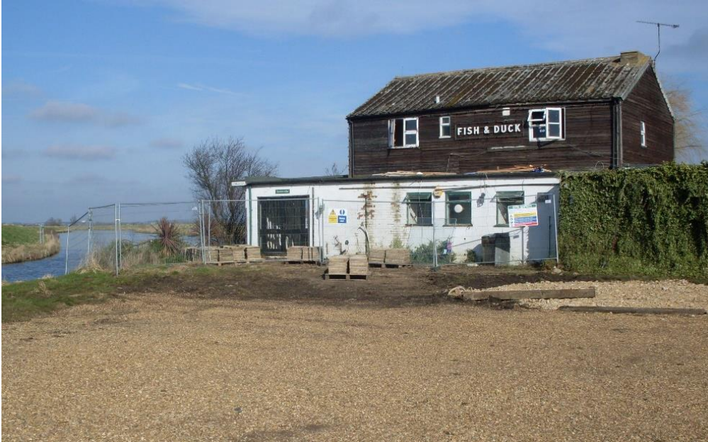
The Fish & Duck on its way out in 2009.

Many moons ago, we had another riverside pub in the shape of the Fish & Duck which was loosely located outside Stretham. Who remembers that? I only ever went a couple of times but I'm told it was popular enough – for a while. I'm sure that yet again, from the riverside it was a nice pub and only a gang-plank-step away, so to speak! But from the roadway it was a tough ask to get too! First opened in the late 1970s it was situated at the Fish & Duck Moorings, the site of an even earlier pub of - naturally - the same name. Having