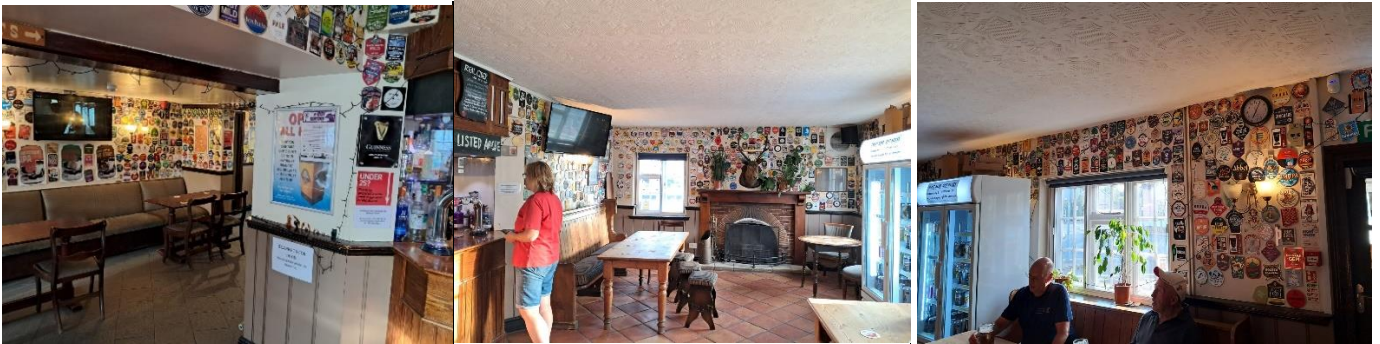
Maybe 1,000 pump clips and beer mats adorn the Gladstone Arms. The beer is excellent too!

All the pubs to here had been close to one another but the next pub was a good ¾ mile away in Combs Ford but felt like it was Stowmarket still. This pub, The Gladstone Arms is in the GBG book as under Combs Ford. There must have been 1,000 pump clips all around the walls, incredible.....The pub was quiet but it was only 5pm and there were four ales on – say 3 - as the Nethergate Fox stopped as it was being poured so I settled on Wild Card Brewery's ESB a 5.5% and a Wadworth 6X at 4.3%. Having had my drink and marvelled at all the pump clips, I should next have checked out The Magpie directly opposite but anyhow, I'd say that it was still worth the trip out to the Gladstone alone.