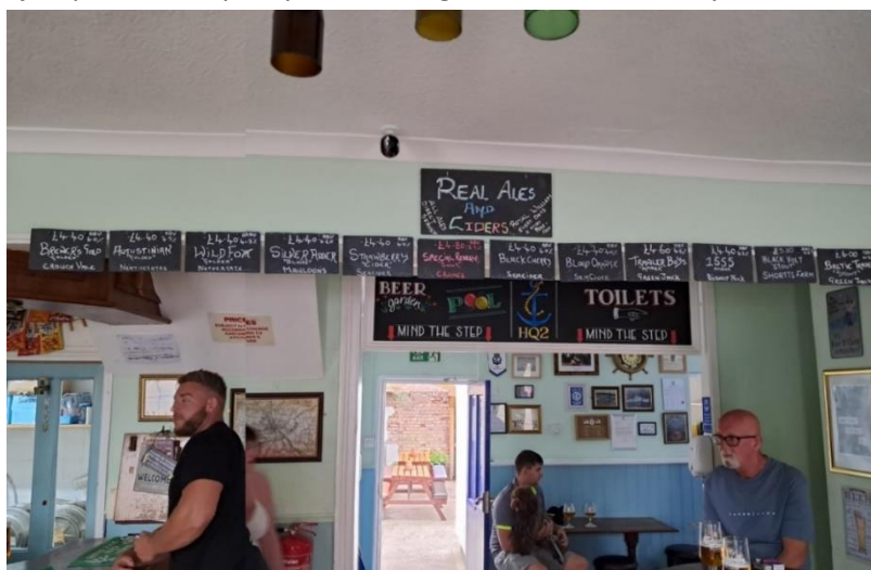
Note the barrels through the left door (bottom left) easily missed.

Imagine my disappointment when I saw no real ale at all; "I'm sorry but I thought I was going to find real ale here?", "You have! we've got it through that door! We have 8 real ales straight-from-the-barrel". I looked and could see 7 of 8 firkins tapped and a couple of pins above them... she was right too! So, off I went trying 6 of them. Chatting away with customers, I eventually realised the knowledgeable man I was trading ale tales with and sat with his customers incognito was the owner! He was right, mild doesn't have to be weak and there's plenty that haven't been too.