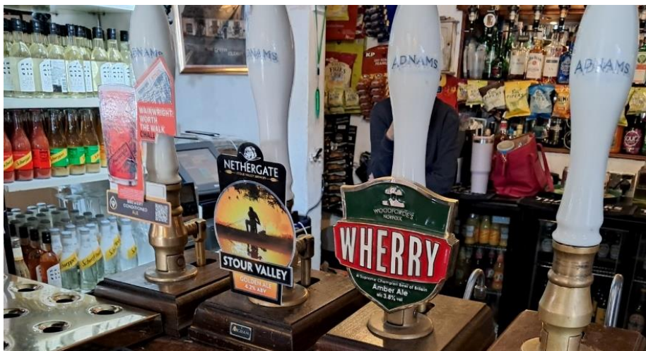
Wainwright's Worth the Walk, Nethergate's Stour Valley, Woodforde's Wherry at The Griffin