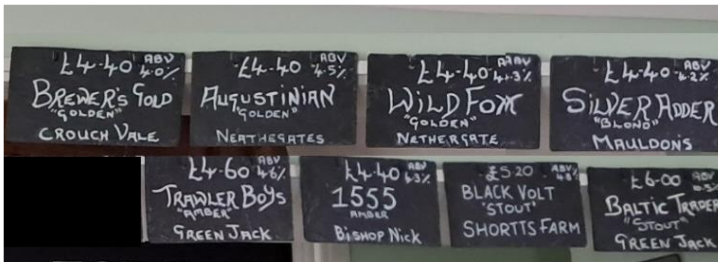
Cropped photo of the 8 ale slates to be found at the Royal William

"Normally, we try and have 2+2+2+2 light to dark beers on but I'm a little out of synch today" he confessed. Onwards then, I'm glad I went back to the Union St corner before heading up to what was to be the second GBG pub – the Walnut – because I bumped into a pub on the corner to The Walnut by the name of The Stag Tavern, the other