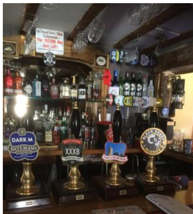
Rumours are of a name change to 'The Murdered Salesman'!

This is said to be so popular that it is now permanently in the pub (my visit was at the end of the August BH) and not only that, another 10 pubs get to sell the Two Churches ale which I trust is how many pubs a brew will spread too. For those that don't know, the likely squire in Swaffham Prior back in the day had two daughters and decided that they should both have a 'modest' Church each as part of their dowry....and facing each other....and next to The Red Lion!