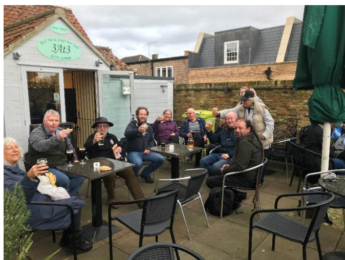
Cheers! The East Norfolk and Ely CAMRA at the 3at3. It was COLD!